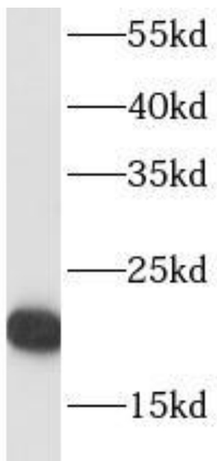
Jurkat cells were subjected to SDS PAGE followed by western blot with FNab07418(RPL18A antibody) at dilution of 1:500