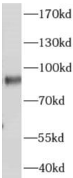
human testis tissue were subjected to SDS PAGE followed by western blot with FNab00256(AKAP4 Antibody) at dilution of 1:1500